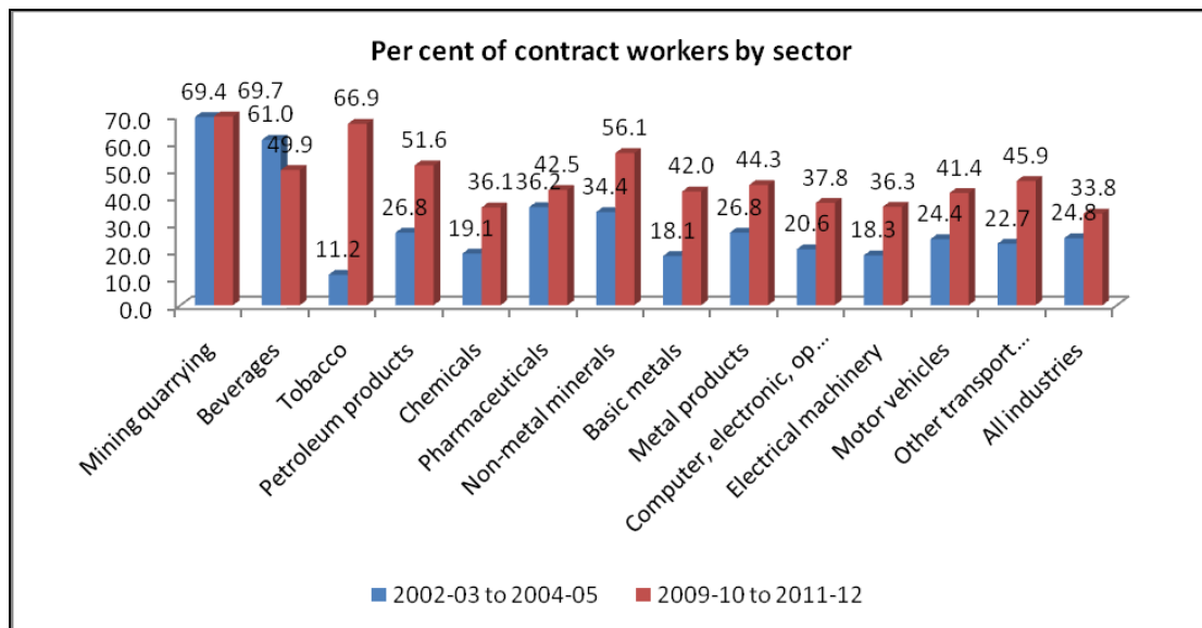
Chart 3: Registered manufacturing sub-sectors with significant use of contract workers

Clearly, Indian industry has proved itself to be adept at simply sidestepping labour laws through widespread use of sub-contracting where possible and use of contract labour without workers' rights in other situations. In this context, the frequent complaints about restrictive labour laws appear to be not just misplaced but even hypocritical, since they have clearly not prevented either public or private employers in registered economic activities from doing precisely as they please without regard to the laws, simply by using contract workers. Surely it is time this gigantic bluff was finally called?