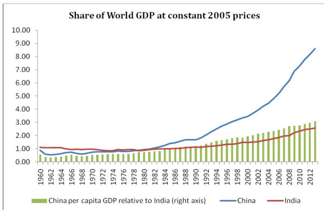
Chart 1: China overtook India in terms of share of world GDP only from 1979 onwards

But as it happens, over the past two decades the differential performance of the two economies has been such that – even with the recent slowdown – China is still likely to account for a larger contribution to global GDP growth than India for some time to come, simply because of its much greater size. Chart 1 describes the share of China and India in global GDP (according to World Bank estimates). This shows that until the late 1970s, the Indian economy was actually larger in size and accounted for a slightly bigger share of world GDP (although it must be borne in mind that Chinese data for that period are notoriously unreliable).